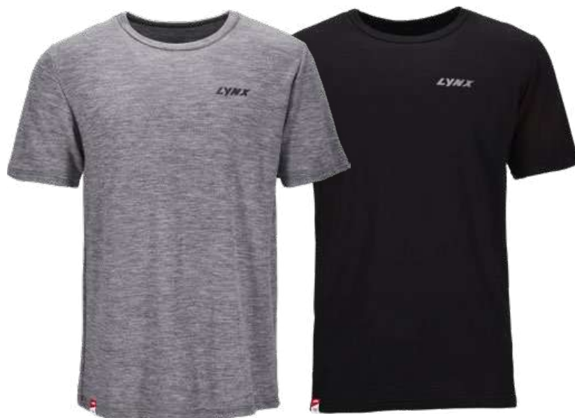
Black (90), Grey (09)