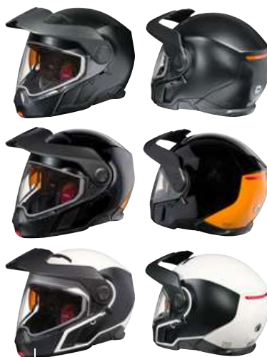
Black (90), Orange (12), White (01)