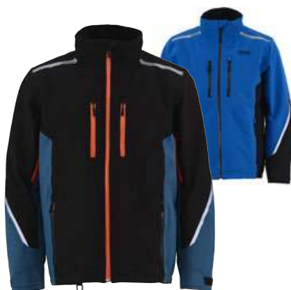
Black (90), Blue (80)