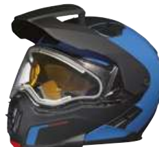
929037 Indigo Blue (82)