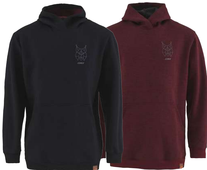
Black (90), Wine (32)