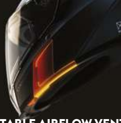
ADJUSTABLE AIRFLOW VENTS