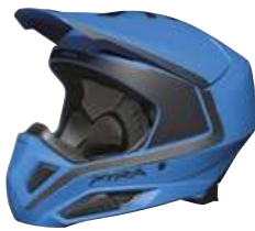
929041 Indigo Blue (82)