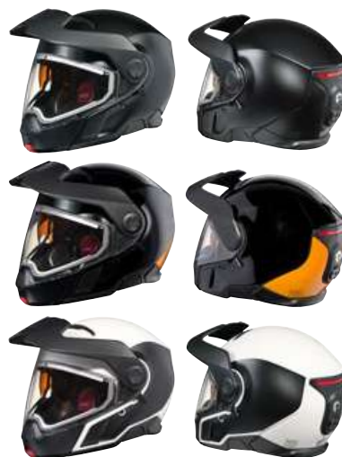
Black (90), Orange (12), White (01)