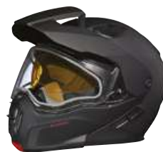
929036 Charcoal Grey (07)