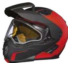
929036 Red (30)