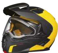
929037 Yellow (10)