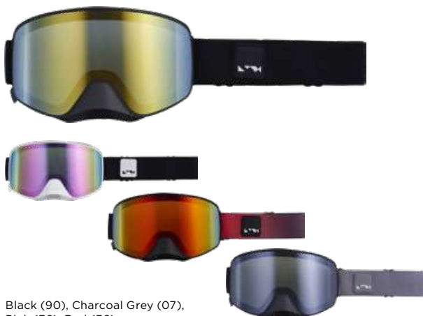
Black (90), Charcoal Grey (07), Pink (36), Red (30)