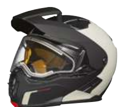
929037 Grey (09)