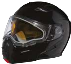
929035 Black (90)