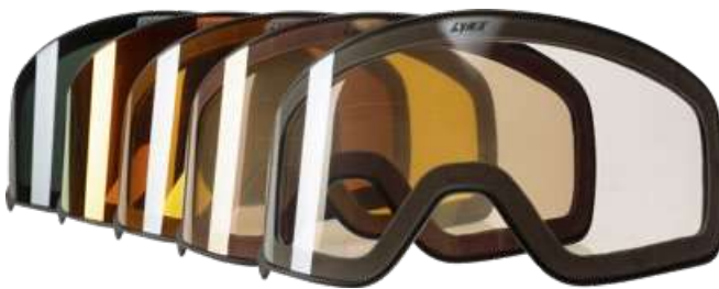
Clear (00), Yellow (10)