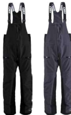
Black (90), Grey (09)