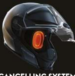
NOISE CANCELLING SYSTEM