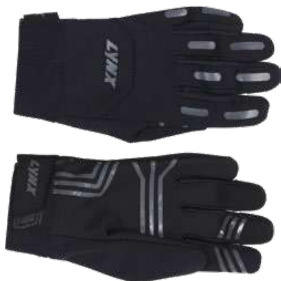
Black with Graphics (94)