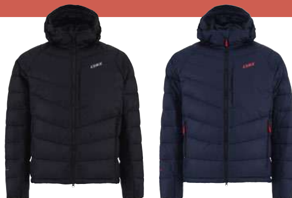
Black (90), Navy (89)