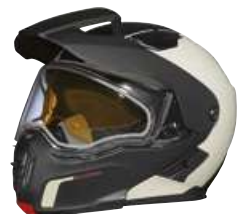
929036 Grey (09)