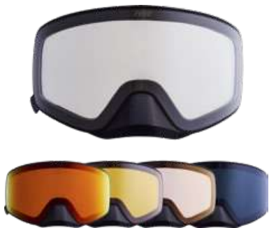
Blue (80), Clear (00), Fire Red (06), Gold (11), Green (70), Pink (36), Smoke (57), Yellow (10)