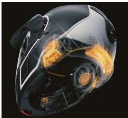
Matte Black (93)