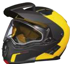
929036 Yellow (10)