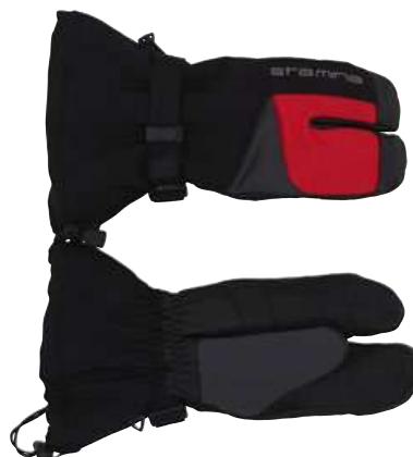
Fire Red (06)