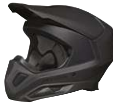
929041 Charcoal Grey (07)