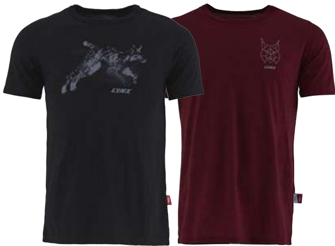
Black (90), Wine (32)