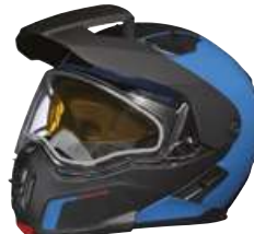
929036 Indigo Blue (82)