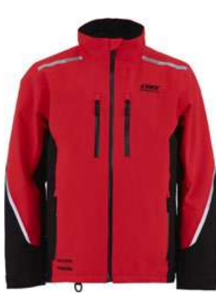
Fire Red (06)