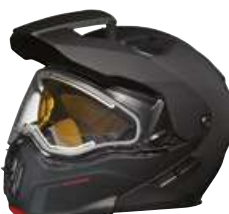
929037 Charcoal Grey (07)