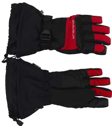
Fire Red (06)