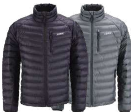
Black (90), Charcoal Grey (07)