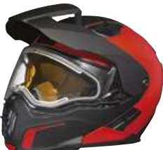
929037 Red (30)