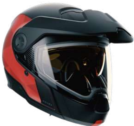
Autumn Red (14)