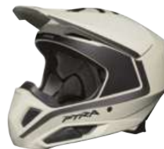
929041 Grey (09)