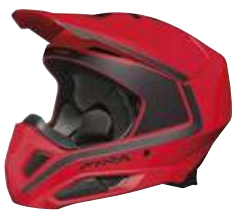
929041 Red (30)