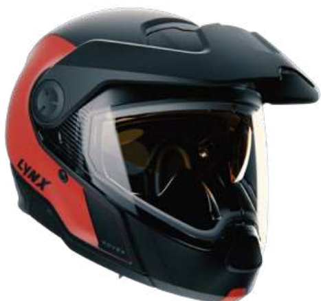
Fire Red (06)