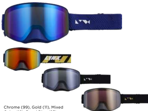
Chrome (99), Gold (11), Mixed Color (18), Royal Blue (83)