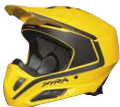
929041 Yellow (10)