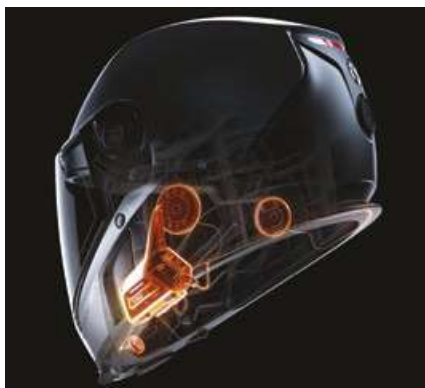
Matte Black (93)