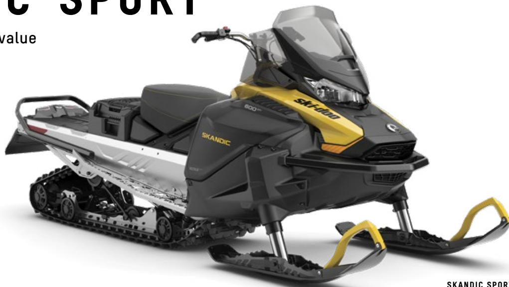
SKANDIC SPORT 600 EFI SHOWN

The best 20-in. utility value in snowmobiling.